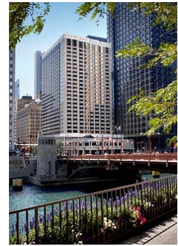
Renaissance Chicago Hotel

The reservation cut-off date is Wednesday, September 5, 2007 make your reservations soon